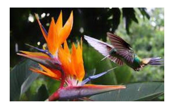
Q: What is the role of the animal and plant kingdoms during this Great Transition to a new era?

R : Members of the animal kingdom have been instrumental in opening the human heart, which is the 'birthplace' of the Soul. The open heart is essential to the evolution of consciousness on the brink of the Aquarian Age. Were it not for the unconditional love abundantly supplied by members of the animal kingdom, the human race would be substantially more limited in its capacity to feel and express love—the fundamental requirement for the Great Turning of the Ages.