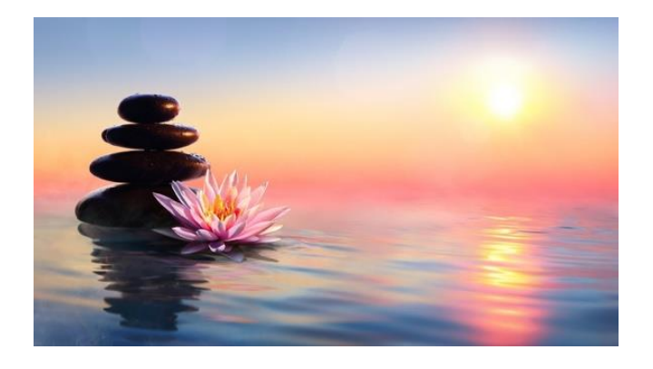
Q: How can we best serve in these times?

R : In chaotic times such as the present, there is a critical need for calm—not an artificial calm, manufactured for appearances by suppressing anxiety and distress, but the calm that belongs to the soul. Genuine calmness flows from the higher Self who knows its purpose for being incarnate at this crucial moment in evolution and is working to fulfill that purpose. Souls such as these are like sentinels arising from the watery depths to guide humanity toward its destination in the New Earth.