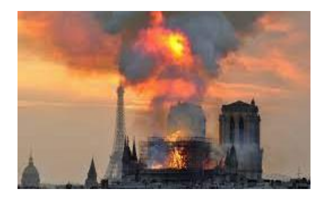
Q: What is the significance of the world watching as flames destroy Notre Dame?