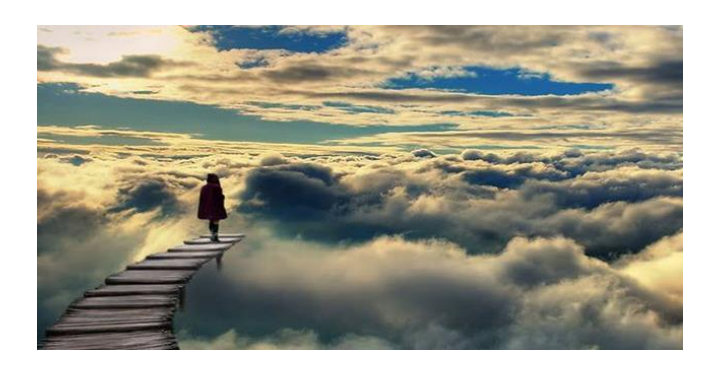
Q: Why are so many children being born with autism and related conditions at this time? What is the best way to help them?

R : Let us first consider the physical causes. The chemical causes of climate change are not unrelated to autism. Pregnant women are more vulnerable to chemicals in the atmosphere that pass through the placenta supporting the embryo, and this can affect the DNA of the child.