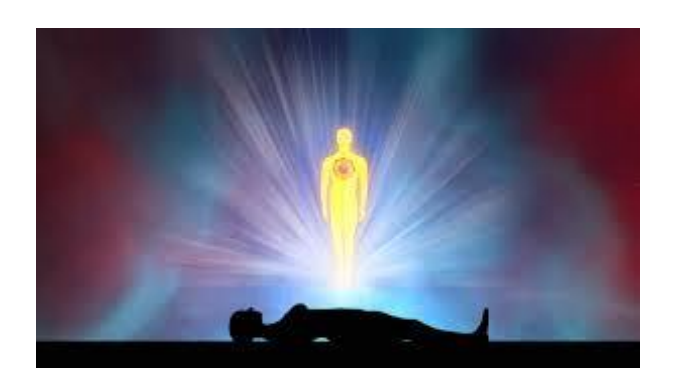
Q: It seems easier to connect with my Soul than with my heart. What is the difference between the two and what is the relationship between them?