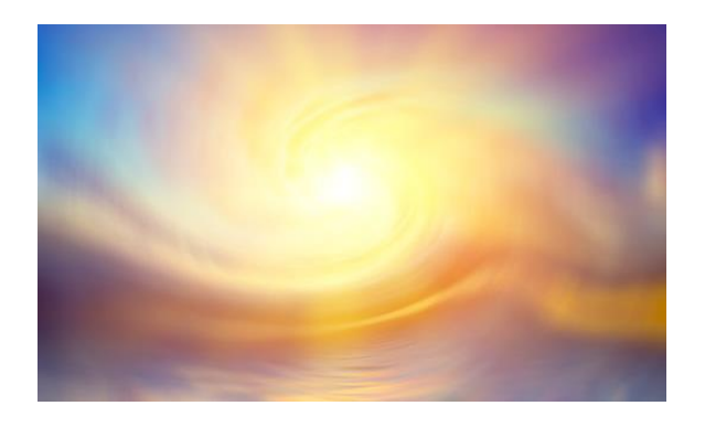
Q: What is the content of the lives of our Elder Brothers? How do They occupy Their time?

R: In brief, our lives revolve around bringing the Plan of God into manifestation. In the decades leading up to the present stage of human awakening, the efforts of the ashrams of several Masters were focused intensely upon the expansion of higher intuition—direct knowing—within the ranks of advanced humanity. In this regard, you will note the stunning developments in science that opened the human mind to the previously unfathomable and unknowable essence of life as Energy. You will note the developments in leading-edge philosophy, psychology, and education related to acknowledging the higher nature of the human being. And you will note the massive increase in humanitarian responses to human and planetary need, growing out of an emerging realization of the interrelatedness and wholeness of human and planetary life.