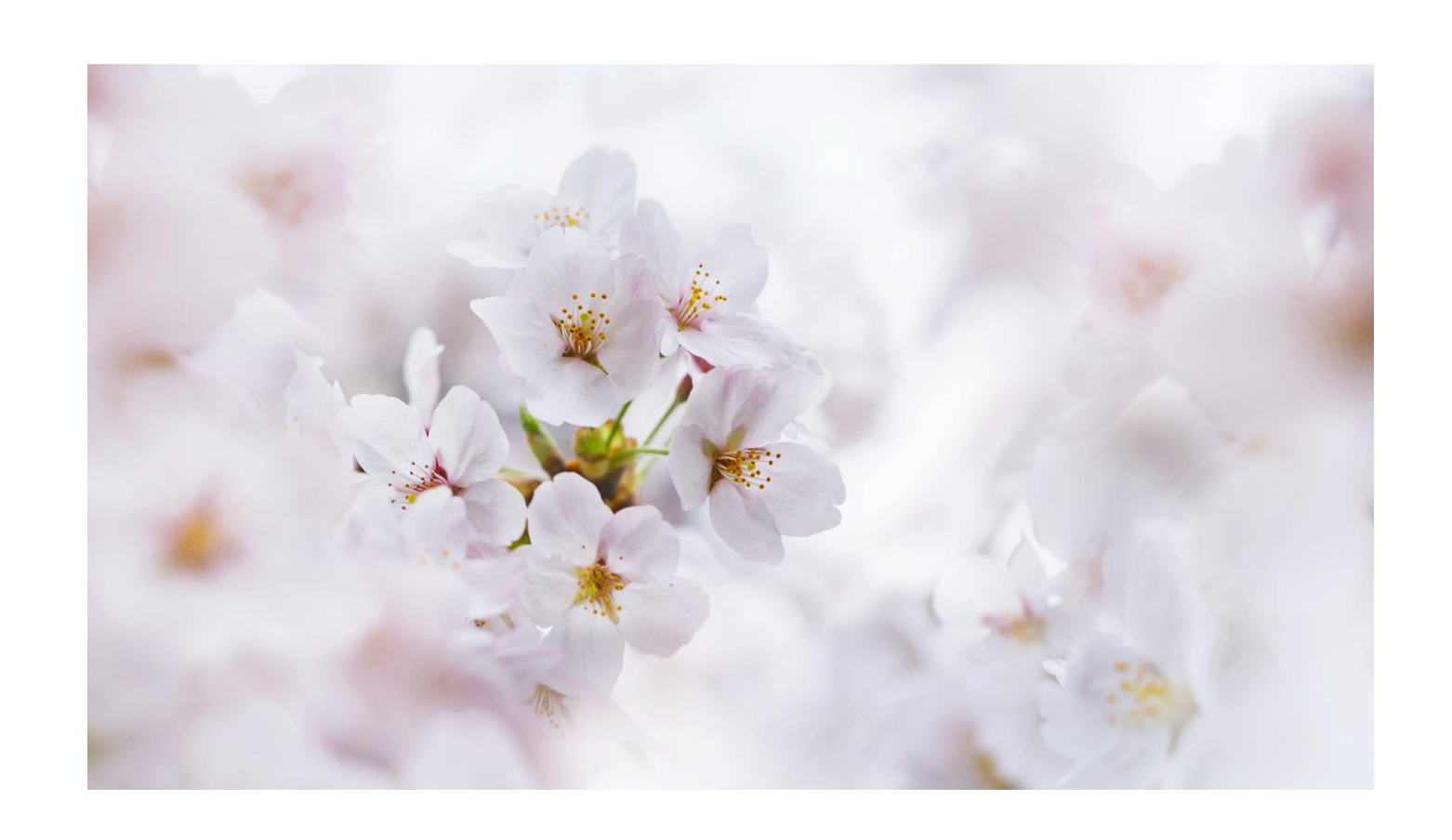
Click here for the next section

At the higher planes of this unitary Life, a Force emanating from beyond the manifest worlds will increasingly make known its Purpose for the design of this expanding Universe.